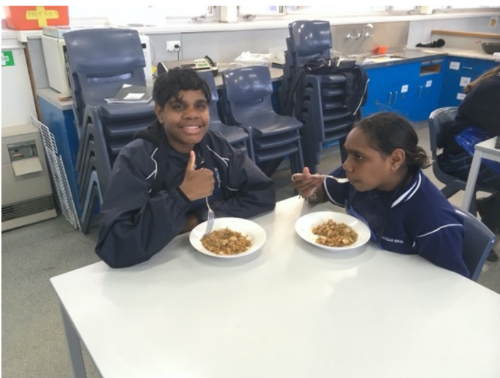
Cooking in Home Economics