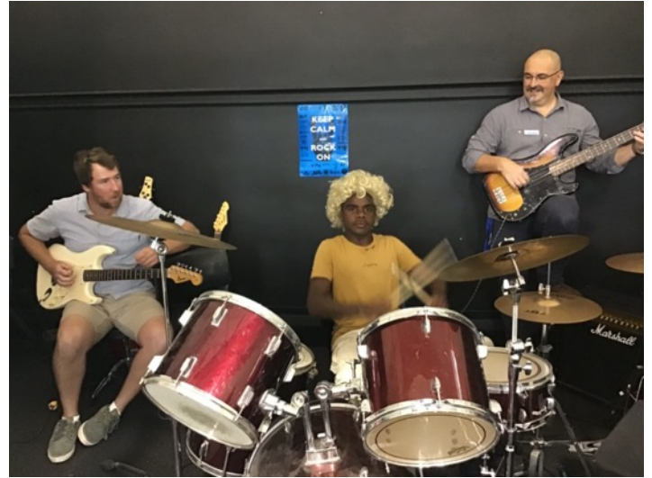
Learning and fun times at Wiltja Boarding