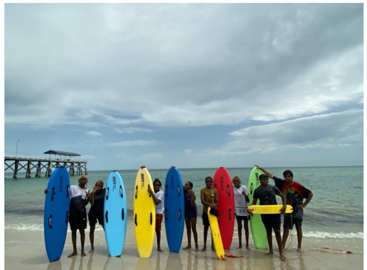
Year level excursion to Grange Beach