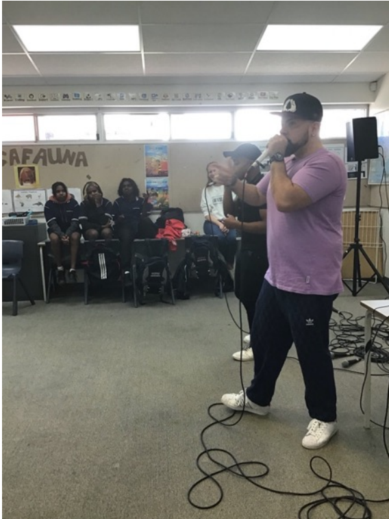
Beatbox Academy workshop